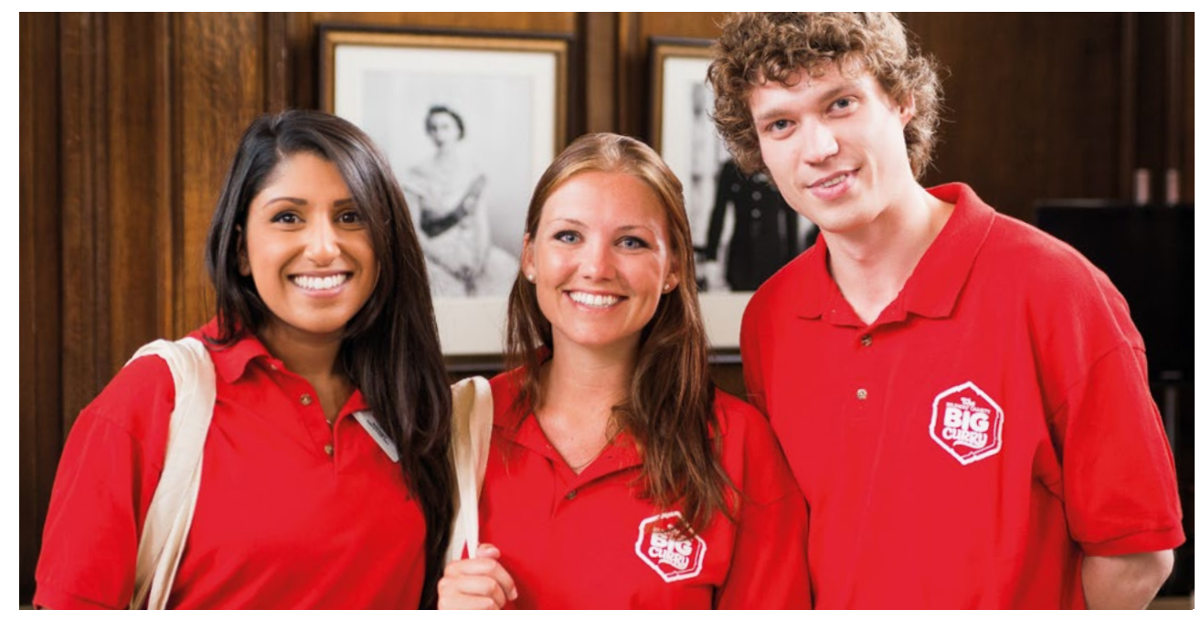
Our employees are dedicated and hard-working. They provide excellent value for money.